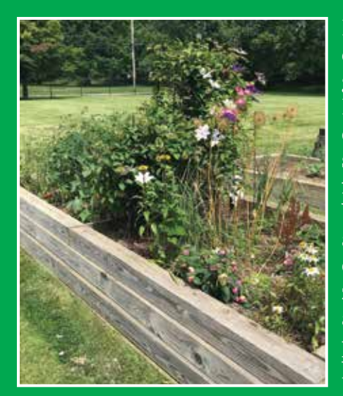
Resident Rita Rodgers oversees the 14 raised gardens on Ohio Living Park Vista's campus. One employee's son volunteers to spade the soil in preparation for them each year, and before you know it, they're all overflowing with a combination of cucumbers, zucchini, peppers, tomatoes and kale. One resident even planted raspberry bushes in her raised garden!

In addition to planting flowers and herbs for the Memory Care Center, the roof of one Ohio Living Westminster-Thurber building is covered in raised gardens! Resident Mike Strautz leads this project and is impressed by the variety of things he sees growing on the roof: "Some people plant vegetables, some do flowers, and some do things just to play around in the dirt!"